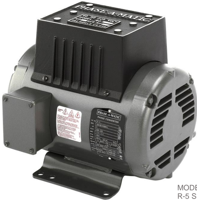
MODEL R-5 SHOWN

RUNS THREE-PHASE EQUIPMENT FROM SINGLE-PHASE POWER SOURCE