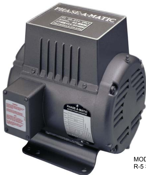
MODEL R-5 SHOWN

RUNS THREE-PHASE EQUIPMENT FROM SINGLE-PHASE POWER SOURCE