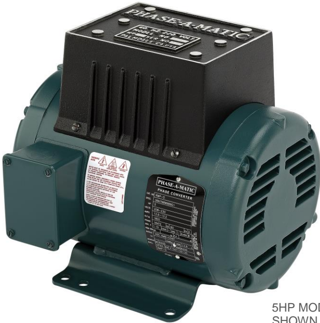
5HP MODEL SHOWN

RUNS THREE-PHASE EQUIPMENT FROM SINGLE-PHASE POWER SOURCE